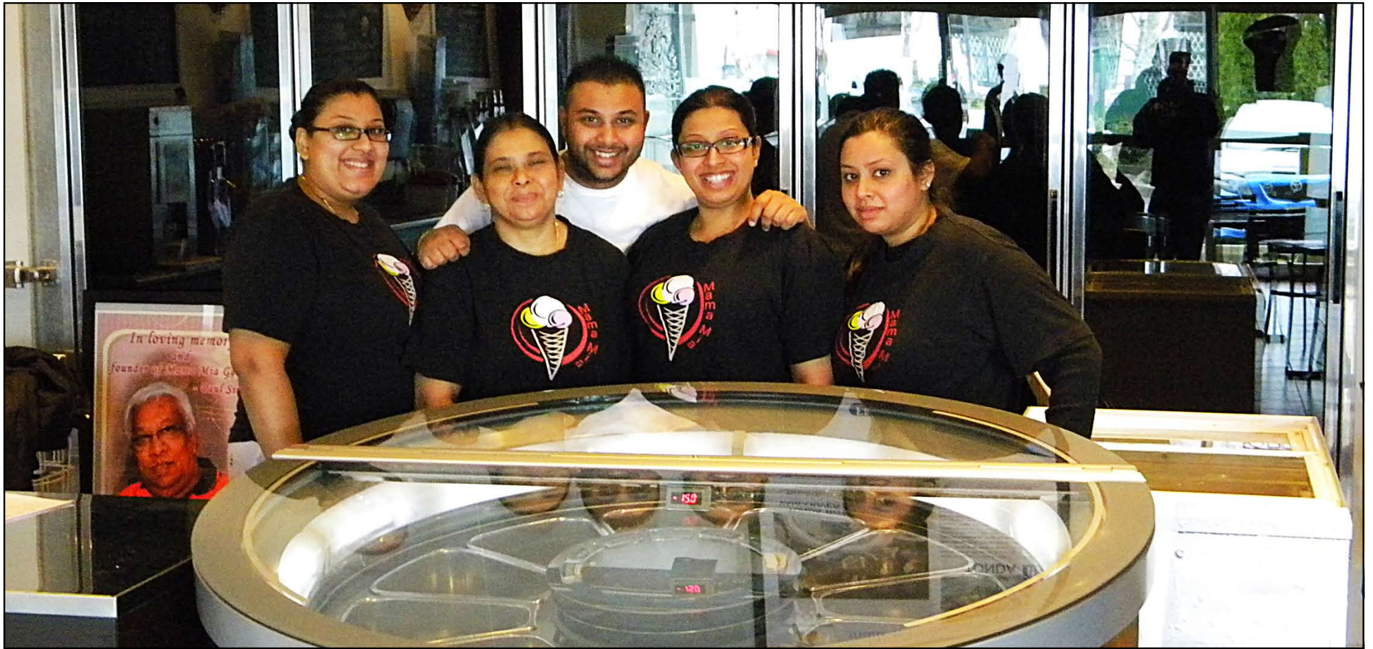
The Singh famiy invested more than $50,000 in their state-of-the-art gelato display unit at their new second location in Surrey.